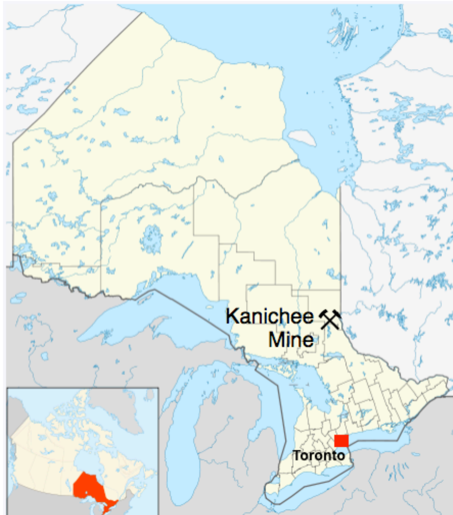
Figure 1.0 – Location of the Kanichee Mine

The Kanichee claim block lies 6.3 to 13.8 kilometres northwest of the town of Temagami, Ontario. Vehicular access to the properties is via forestry access roads extended westward off Trans Canada Highway 11 at 4.8 and 9.5 kilometres north of the town of Temagami (Figure 1.0).